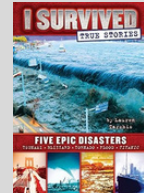
I Survived! True Stories: Five Epic Disasters by Lauren Tarshis