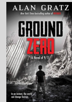
Ground Zero by Alan Gratz