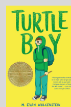
Turtle Boy by W. Evan Wolkenstein