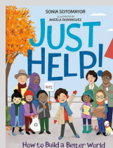
Just Help!: How to Build a Better World by Sonia Sotomayor